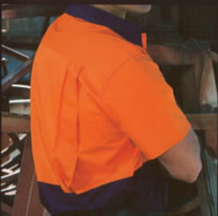
WS6495 2 tone, short sleeves, Orange/Navy and Yellow/Navy.