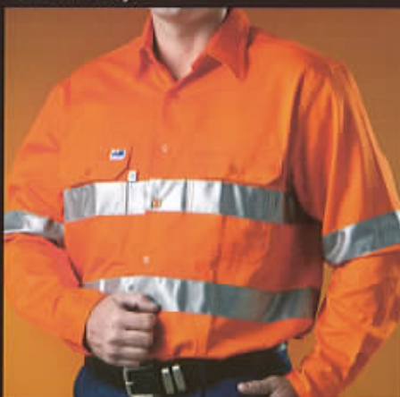
WS918498 Plain with tape, Orange.

These garments comply with Australian Standards AS/NZS 1906.4 & AS/NZS 4602:1999 Un-taped garments – Class D (Orange – dry state) Taped garments – Class D/N (Orange – dry state) UPF50+