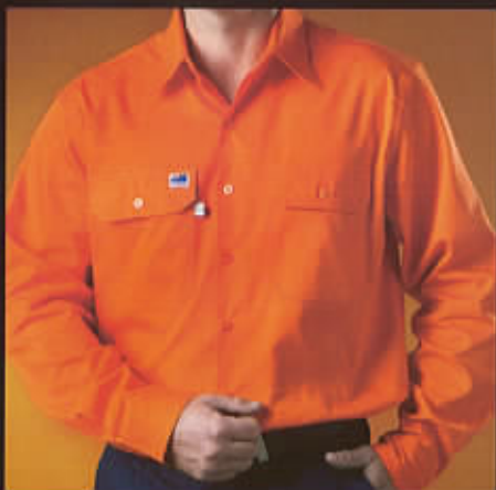
WS4498 Plain Orange.