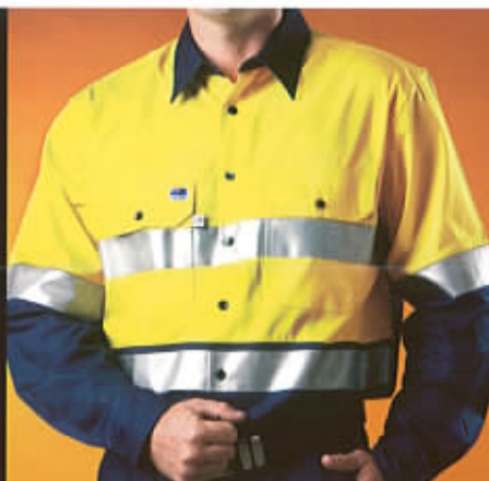
WS9186498 2 tone with tape, Orange/Navy, Yellow/Green, Yellow/Navy.