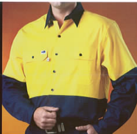
WS6498 2 tone, Orange/Navy, Yellow/Green, Yellow/Navy.